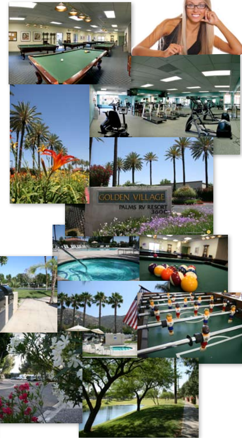
All photos on this page were taken at a Sunland RV Resort.

"Sunland RV Resorts are conveniently located throughout Southern California."